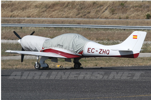
Lancair 360 Canopy Cover, Engine Cover