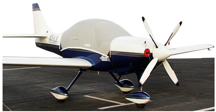
Lancair ES Canopy Cover