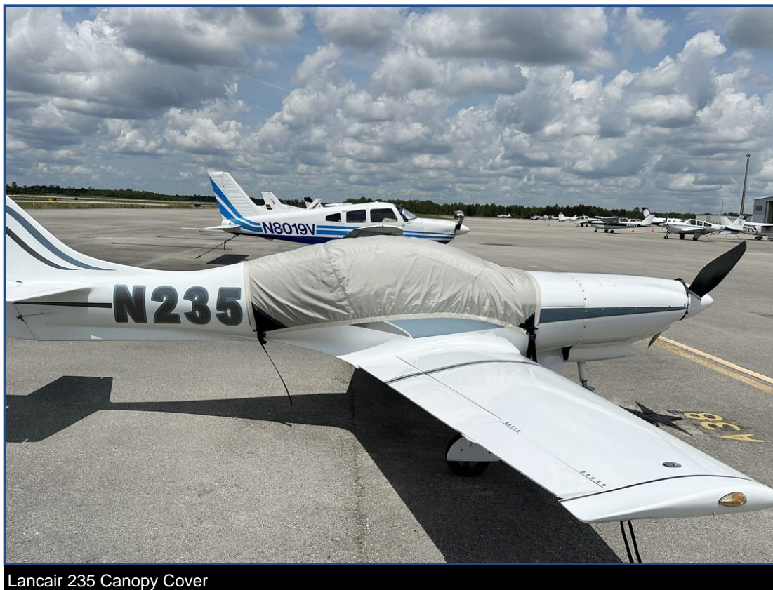
Lancair 235 Canopy Cover