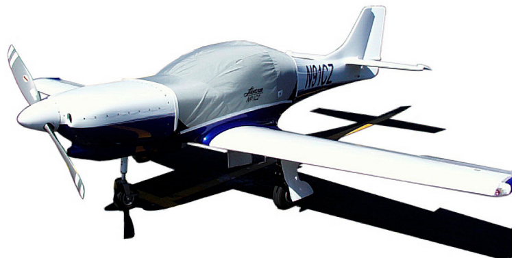
Canopy Cover for Lancair 320/360