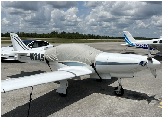
Lancair 235 Canopy Cover

Travel Covers are made with Silver Solution-Dyed Polyester fabric and only lined over the windshield to save weight. The material is lightweight and more compact for easy stowage in the aircraft. The polyester material is water resistant, but only intended for occasional use outside. We also have an ultra lightweight material available for fitted hangar dust covers. For daily outdoor use, the non-travel Sunbrella Cover is the best choice.