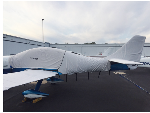
Lancair ES Wing Covers & Empennage Cover (sold separately)