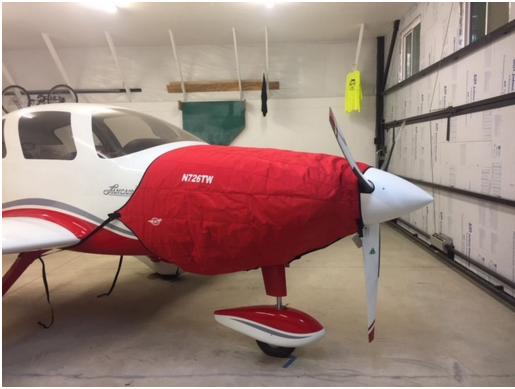
Lancair ES Insulated Engine Cover, Fully Enclosed