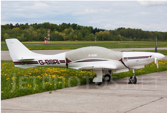
Lancair 235 Canopy Cover

This cover type is made from Silver Acrylic Sunbrella canvas and is 100% lined with a soft and smooth microfiber. Bruce's Custom Covers developed this material combination especially for aircraft protection. The outer material is medium weight and treated for water resistance, UV resistance and anti-static buildup. The inner lining is a very soft and smooth microfiber to prevent scratching. The material is very reflective, and tests show that the cabin interior temperature can be reduced to near-ambient temperature on the hottest of days. It is water, ice and snow repellent, yet breathable to allow moisture to escape from between the cover and the aircraft surface.