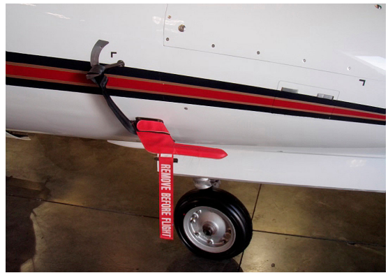
Learjet Heat Resistant Pitot Cover with AOA strap