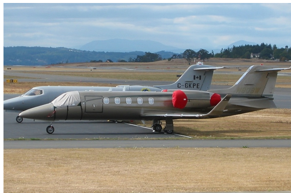
Lear 31A Cockpit Cover, Engine Covers