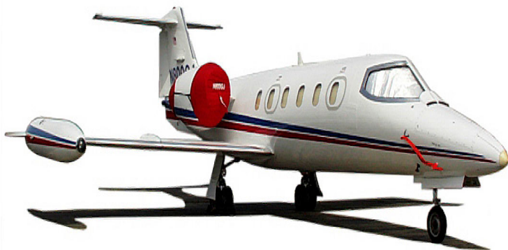
Lear 35 Engine Covers, Pitot Covers & Cockpit HeatShields

The Lear 24 & 25 Bikini Style Engine Covers are a single-piece design using a soft and smooth stretchy and fabric. The cover stretches tightly over both the intake and exhaust, installing quickly and easily. These covers are designed to be used as hangar dust covers and have a useful life of approximately one year.