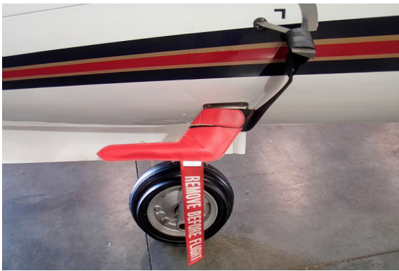
Learjet Heat Resistant Pitot Cover and AOA Strap

The Engine Inlet Plugs are custom fit for your Lear 24 & 25 intakes, made with heavy-duty vinyl material, and stuffed with a single block of sculpted urethane foam. Each plug has a zipper that allows the foam to be removed and dried if necessary. Engine plugs have 'remove before flight' streamers sewn onto the face of the plugs. Most plugs are imprinted with the aircraft registration number in black for an extra charge. Storage bag NOT included. Engine plugs may be inserted after flight when the engine is still warm. Engine Inlet Plugs are commonly referred to as Cowl Plugs, Intake Plugs, Cowl Blocks, Engine Blocks, and Engine Bungs.