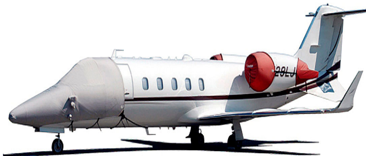
Lear 45 Windshield/Nose & Engine Cover Set