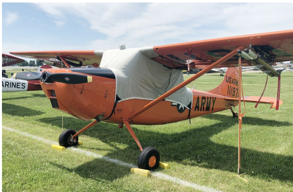
Cessna L-19 Bird Dog Canopy Cover

This cover type is made from Silver Acrylic Sunbrella canvas and is 100% lined with a soft and smooth microfiber. Bruce's Custom Covers developed this material combination especially for aircraft protection. The outer material is medium weight and treated for water resistance, UV resistance and anti-static buildup. The inner lining is a very soft and smooth microfiber to prevent scratching. The material is very reflective, and tests show that the cabin interior temperature can be reduced to near-ambient temperature on the hottest of days. It is water, ice and snow repellent, yet breathable to allow moisture to escape from between the cover and the aircraft surface.