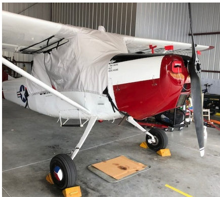
Cessna Bird Dog, L-19, O-1, 305 Canopy Cover, Over-Top Type