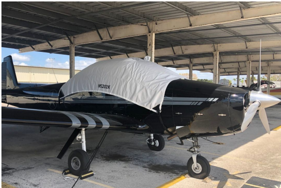
Navion L-17 Canopy Cover

This cover type is made from Silver Acrylic Sunbrella canvas and is 100% lined with a soft and smooth microfiber. Bruce's Custom Covers developed this material combination especially for aircraft protection. The outer material is medium weight and treated for water resistance, UV resistance and anti-static buildup. The inner lining is a very soft and smooth microfiber to prevent scratching. The material is very reflective, and tests show that the cabin interior temperature can be reduced to near-ambient temperature on the hottest of days. It is water, ice and snow repellent, yet breathable to allow moisture to escape from between the cover and the aircraft surface.