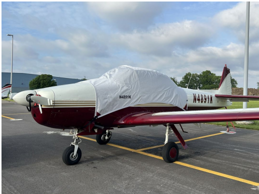
Navion Canopy Cover