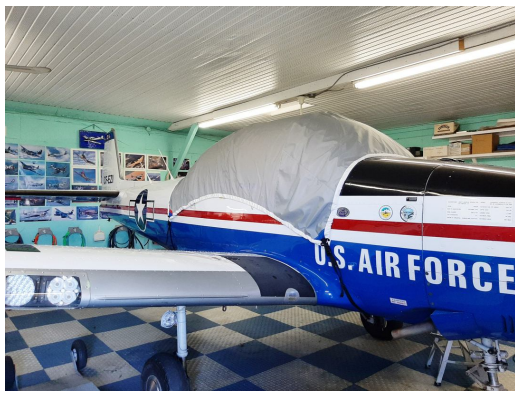
Navion L-17 Travel Cover, Light Weight Canopy Cover (w/without avionics bay extension)