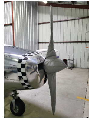
Navion L-17 Insulated Propellor/Spinner Cover, 2 Blade