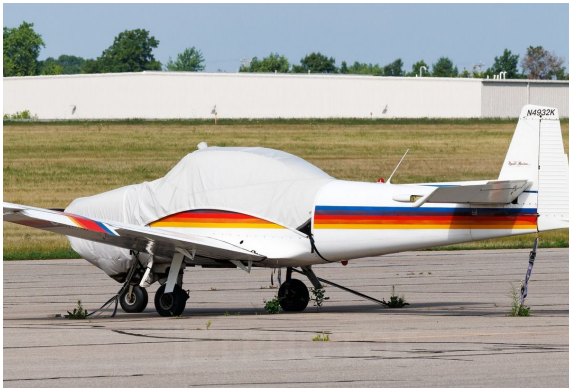
Navion Canopy Cover, Engine Cover (fully enclosed)