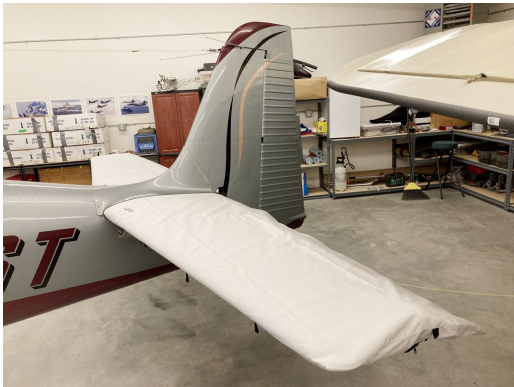
Navion Rangemaster Horizontal Stabilizer Covers