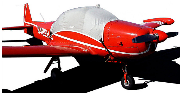
Navion Standard Canopy Cover on Long Slope Windshield Model