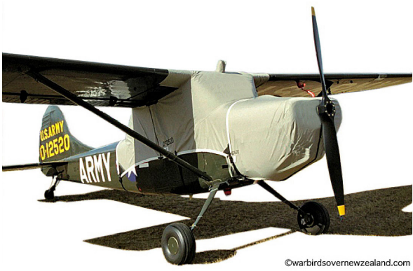
Cessna L-19 Canopy & Engine Covers