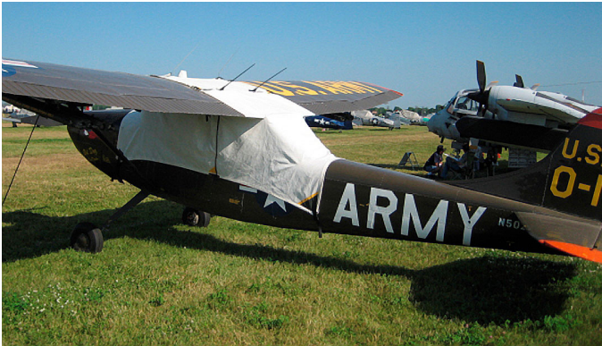
L-19 Canopy Cover

water resistance, UV resistance and anti-static buildup. The inner lining is a very soft and smooth microfiber to prevent scratching. The material is very reflective, and tests show that the cabin interior temperature can be reduced to near-ambient temperature on the hottest of days. It is water, ice and snow repellent, yet breathable to allow moisture to escape from between the cover and the aircraft surface.