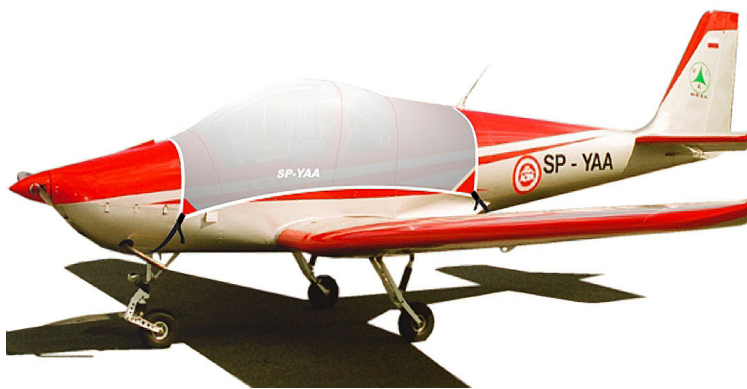
Kappa KP-5 Canopy Cover (illustration)

This cover type is made from Silver Acrylic Sunbrella canvas and is 100% lined with a soft and smooth microfiber. Bruce's Custom Covers developed this material combination especially for aircraft protection. The outer material is medium weight and treated for water resistance, UV resistance and anti-static buildup. The inner lining is a very soft and smooth microfiber to prevent scratching. The material is very reflective, and tests show that the cabin interior temperature can be reduced to near-ambient temperature on the hottest of days. It is water, ice and snow repellent, yet breathable to allow moisture to escape from between the cover and the aircraft surface.