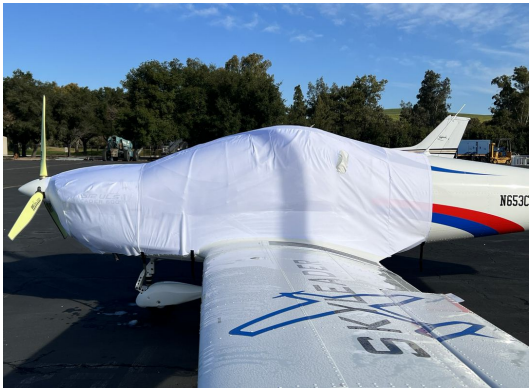
Jihlavan JA-600 Skyleader Extended Canopy/Engine Cover, test fit cover