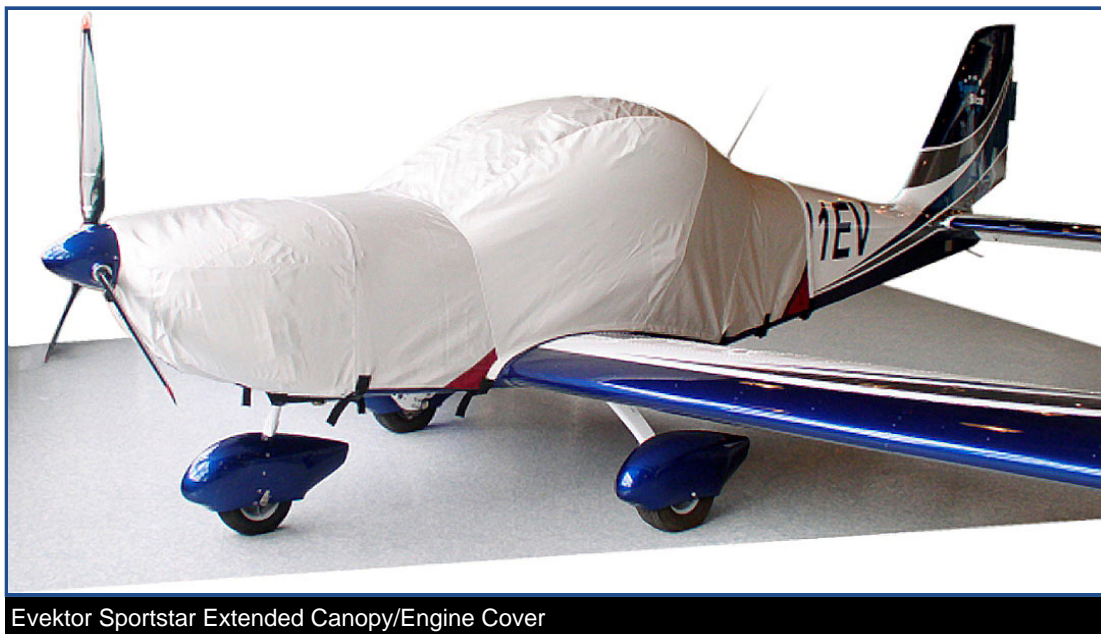
Evektor Sportstar Extended Canopy/Engine Cover