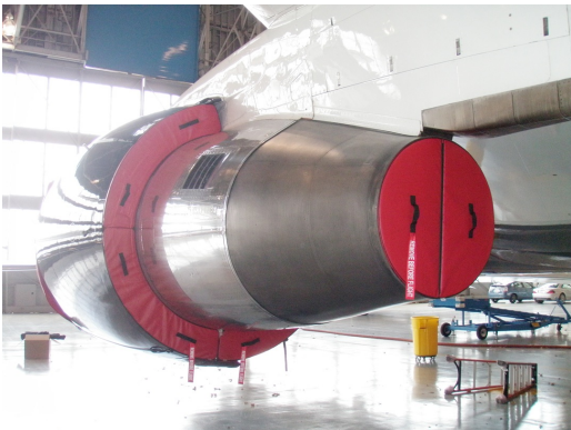
Exhaust Plugs Ship Set, incl. Fan Thrust Reverser and Exhaust Plugs P/N: B767-200