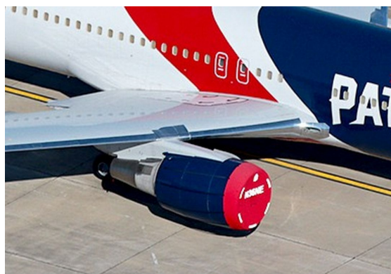
Boeing 767 Intake Covers