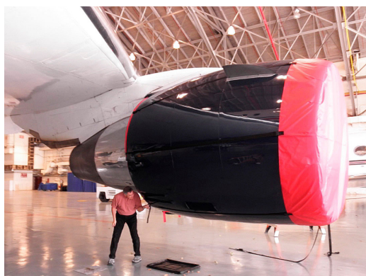
Boeing 767 Intake Covers Ship Set