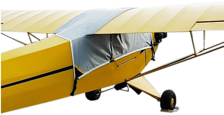
Piper J3 Over-Top Canopy Cover