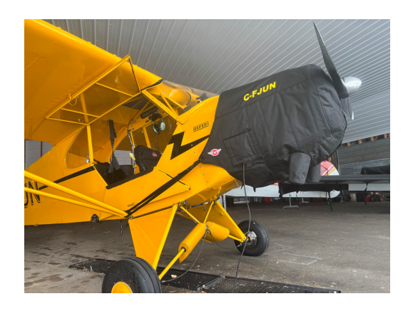
Piper J3 Cub Insulated Engine Cover