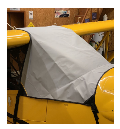
Cub Crafters Carbon Cub FX3 Windshield/Skylight Cover, travel weight