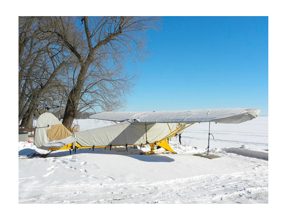
Piper J3 Cub Full Cover Set