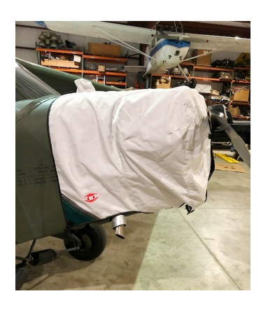
Piper J3C-65 Engine Cover