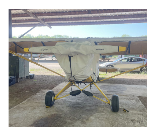
Piper J-3C-65 Cub Engine Cover, Fully Enclosed