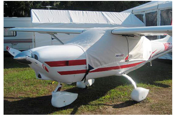
Jabiru 230-SP Canopy Cover, Over-top style