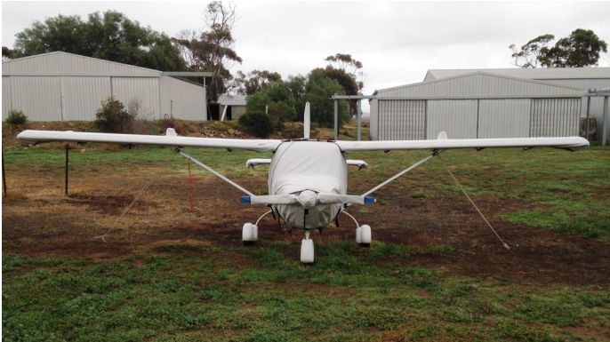
Jabiru 160 Canopy, Engine, Prop, Wings & Empennage Covers Jabiru 160 Canopy, Engine, Prop, Wings & Empennage Covers