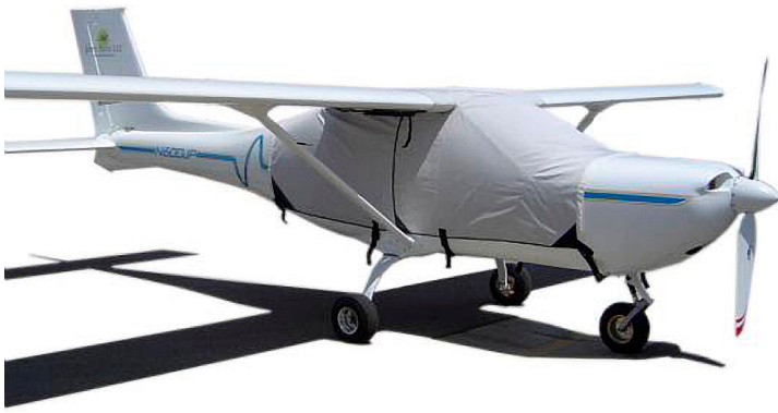
Jabiru Extended Canopy Cover