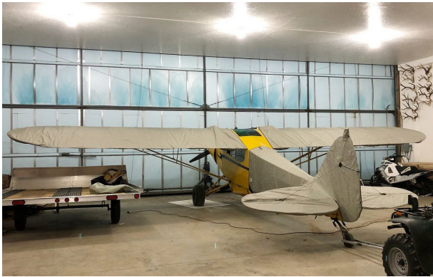
Piper Super Cub Wing & Empennage Covers