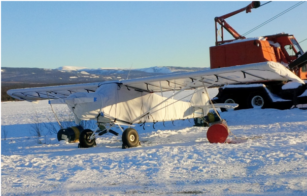
Piper Super Cub Complete Cover Set

ALL-YEAR USE MATERIAL - Made with Silver Acrylic Sunbrella canvas, the all-year use material is the best option for sun protection and cover longevity. This heavier more durable material is intended for all weather conditions, such as rain and snow or lots of sun.