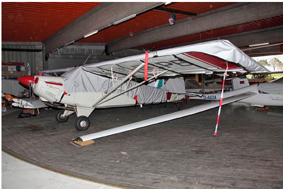
Aviat Husky Engine Plugs, Canopy, Wing & Empennage Covers