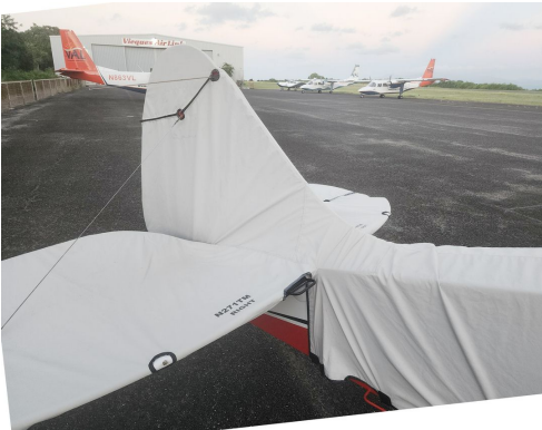
Aviat Husky Empennage Cover

WINTER USE MATERIAL - Made with Solution-Dyed Polyester fabric, this option is intended for seasonal use to aid in deicing, rain mitigation, or for occasional travel. The material is lighter and more compact, but more susceptible to UV damage and may have a shorter useful life if used continuously outside than the all-year use material.