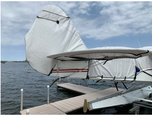
Aviat Husky Empennage Cover