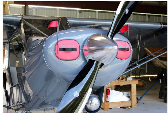
Piper PA-18 Super Cub Engine Inlet Plugs