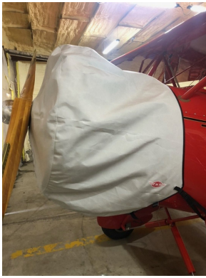
Hatz Biplane CB-1 Engine Cover