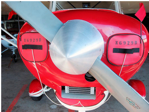
Piper PA-22-150 Engine Inlet Plugs (set of 3)

Engine Inlet Plugs are custom fit for your Hatz Biplane CB-1 intakes, made with heavy-duty vinyl material, and stuffed with a single block of sculpted urethane foam. Each plug has a zipper that allows the foam to be removed and dried if necessary. Engine plugs have warning flags that are visible from the cockpit or 'remove before flight' streamers sewn onto the face of the plugs. Most plugs are imprinted with the aircraft registration number in black for an extra charge. Storage bag NOT included. Engine plugs may be inserted after flight when the engine is still warm. Engine Inlet Plugs are commonly referred to as Cowl Plugs, Intake Plugs, Cowl Blocks, Engine Blocks, and Engine Bungs.