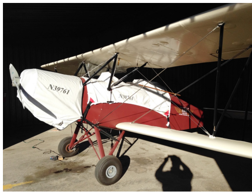
Hatz Biplane Canopy and Engine Covers