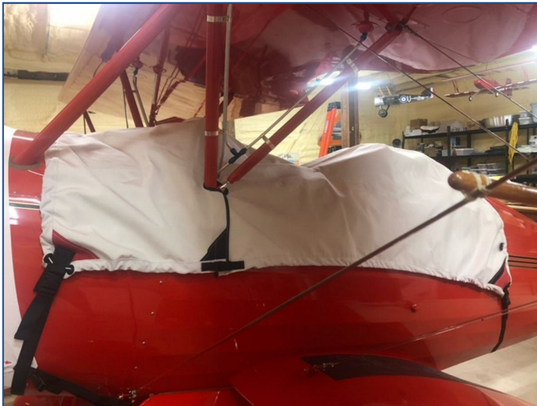
Hatz Biplane CB-1 Canopy Cover