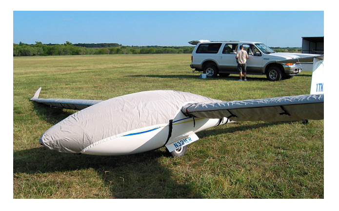
Canopy/Nose Cover, Wings and Horizontal Stab Covers