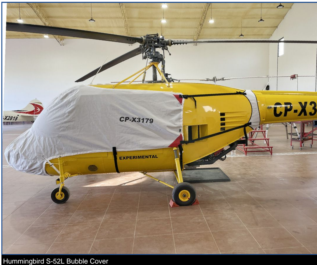
Hummingbird S-52L Bubble Cover