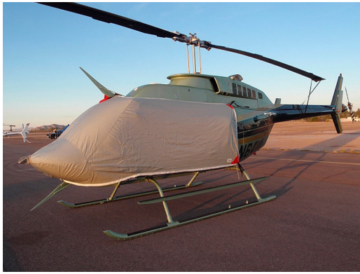
Bell 206L Longranger Bubble Cover