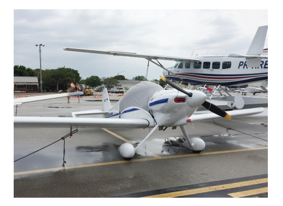
Van's RV-4/Harmon Rocket Travel Cover