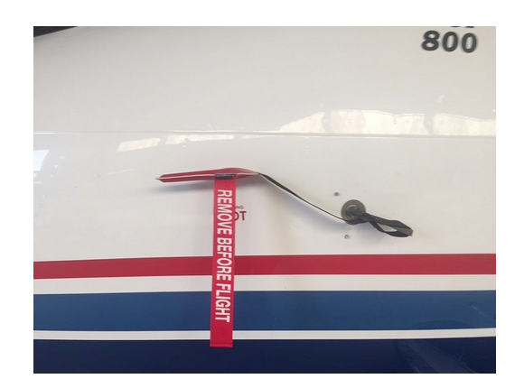
Hawker Beechcraft 800, 800XP, 850XP Pitot Covers With Aoa Straps

The Engine Inlet Plugs are custom fit for your Hawker Beechcraft 900XP intakes, made with heavy-duty vinyl material, and stuffed with a single block of sculpted urethane foam. Each plug has a zipper that allows the foam to be removed and dried if necessary. Engine plugs have 'remove before flight' streamers sewn onto the face of the plugs. Most plugs are imprinted with the aircraft registration number in black for an extra charge. Storage bag NOT included. Engine plugs may be inserted after flight when the engine is still warm. Engine Inlet Plugs are commonly referred to as Cowl Plugs, Intake Plugs, Cowl Blocks, Engine Blocks, and Engine Bungs.