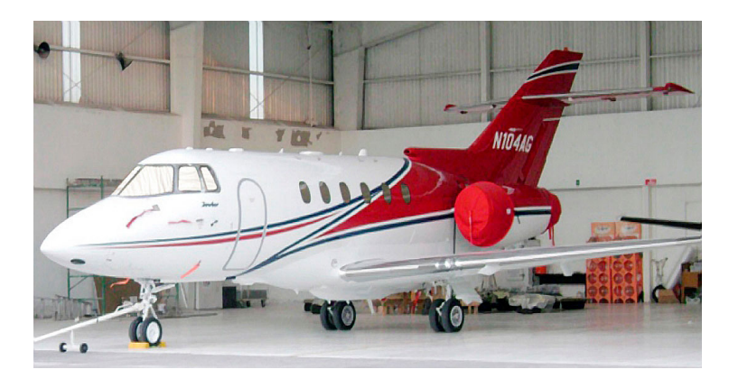
Hawker 900XP Engine Covers, Cockpit HeatShields, and Pitots/AOA Cover set