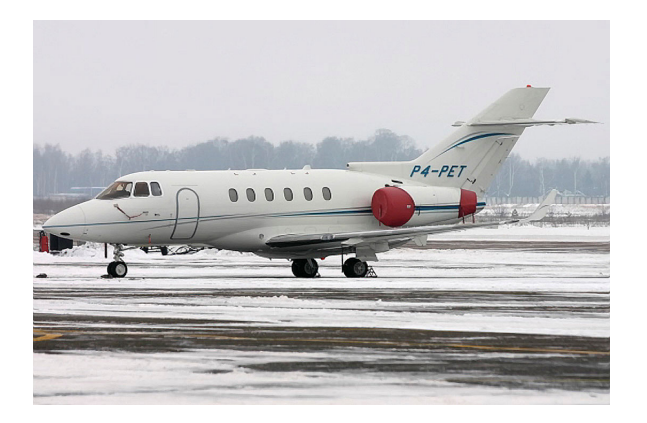
Hawker 900XP Tri-Fold Engine Intake/Exhaust Cover Set