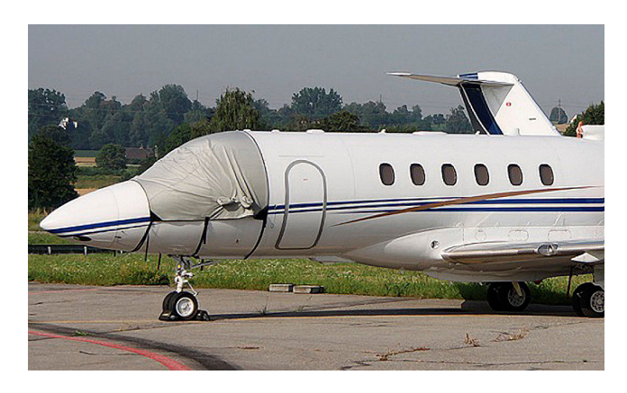
Hawker 800 Cockpit Cover

This cover type is made from Silver Acrylic Sunbrella canvas and is 100% lined with a soft and smooth microfiber. Bruce's Custom Covers developed this material combination especially for aircraft protection. The outer material is medium weight and treated for water resistance, UV resistance and anti-static buildup. The inner lining is a very soft and smooth microfiber to prevent scratching. The material is very reflective, and tests show that the cabin interior temperature can be reduced to near-ambient temperature on the hottest of days. It is water, ice and snow repellent, yet breathable to allow moisture to escape from between the cover and the aircraft surface.