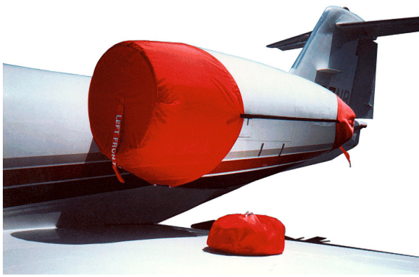
Lear 35 Engine Covers