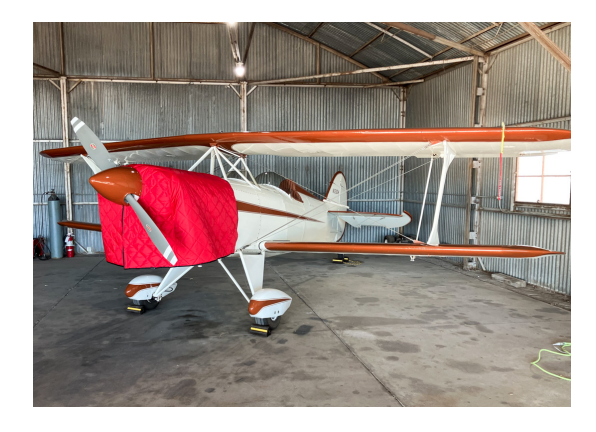
Travel Air 4000 Canopy and Engine Covers, light weight travel type SKYBOLT, Insulated Hangar Blanket, Custom Fit Interior Use)