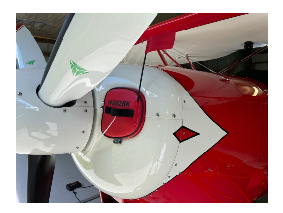
Great Lakes Engine Plugs

Engine Inlet Plugs are custom fit for your Great Lakes Sport Biplane intakes, made with heavy-duty vinyl material, and stuffed with a single block of sculpted urethane foam. Each plug has a zipper that allows the foam to be removed and dried if necessary. Engine plugs have warning flags that are visible from the cockpit or 'remove before flight' streamers sewn onto the face of the plugs. Most plugs are imprinted with the aircraft registration number in black for an extra charge. Storage bag NOT included. Engine plugs may be inserted after flight when the engine is still warm. Engine Inlet Plugs are commonly referred to as Cowl Plugs, Intake Plugs, Cowl Blocks, Engine Blocks, and Engine Bungs.