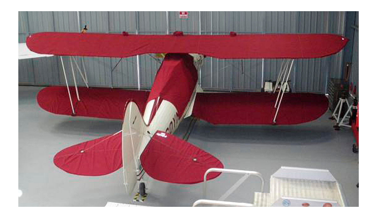
Waco UPF-7 Upper/Lower Wing Cover, Horizontal Stabilizer Cover, & Canopy Cover