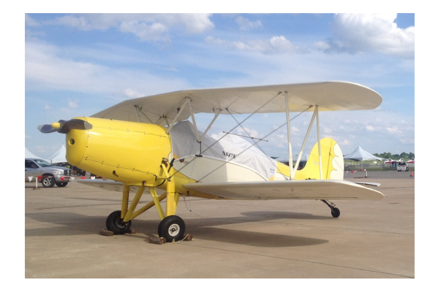
Great Lakes Canopy Cover

This cover type is made from Silver Acrylic Sunbrella canvas and is 100% lined with a soft and smooth microfiber. Bruce's Custom Covers developed this material combination especially for aircraft protection. The outer material is medium weight and treated for water resistance, UV resistance and anti-static buildup. The inner lining is a very soft and smooth microfiber to prevent scratching. The material is very reflective, and tests show that the cabin interior temperature can be reduced to near-ambient temperature on the hottest of days. It is water, ice and snow repellent, yet breathable to allow moisture to escape from between the cover and the aircraft surface.