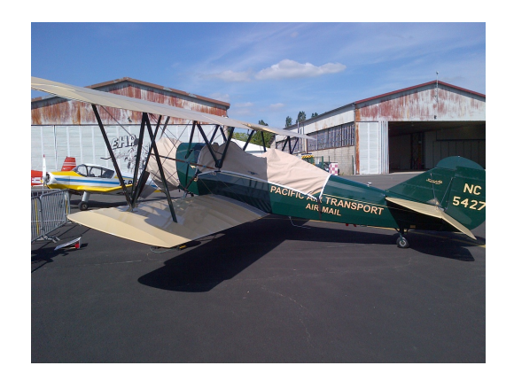
Travelair 4000 Canopy and Engine Cover