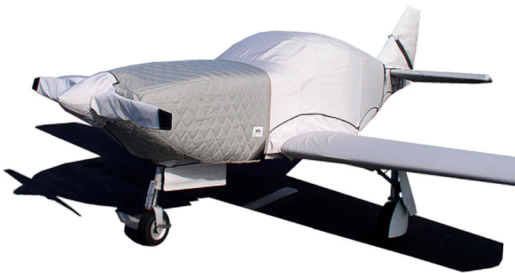
Glasair I Insulated Engine Cover, Prop Cover, Etc.

This cover type is made from Silver Acrylic Sunbrella canvas and is 100% lined with a soft and smooth microfiber. Bruce's Custom Covers developed this material combination especially for aircraft protection. The outer material is medium weight and treated for water resistance, UV resistance and anti-static buildup. The inner lining is a very soft and smooth microfiber to prevent scratching. The material is very reflective, and tests show that the cabin interior temperature can be reduced to near-ambient temperature on the hottest of days. It is water, ice and snow repellent, yet breathable to allow moisture to escape from between the cover and the aircraft surface.