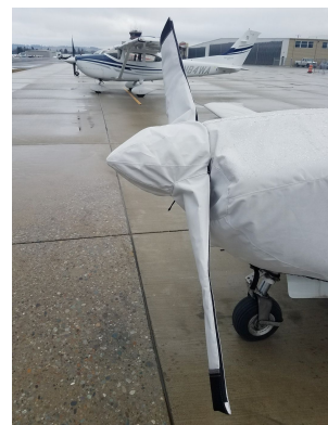
Glasair Aviation Glasair II & III Propellor/Spinner Cover, 2 Blade