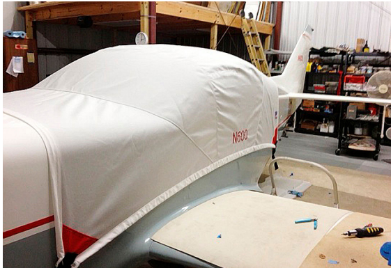
Glasair II/III Canopy Cover

This cover type is made from Silver Acrylic Sunbrella canvas and is 100% lined with a soft and smooth microfiber. Bruce's Custom Covers developed this material combination especially for aircraft protection. The outer material is medium weight and treated for water resistance, UV resistance and anti-static buildup. The inner lining is a very soft and smooth microfiber to prevent scratching. The material is very reflective, and tests show that the cabin interior temperature can be reduced to near-ambient temperature on the hottest of days. It is water, ice and snow repellent, yet breathable to allow moisture to escape from between the cover and the aircraft surface.