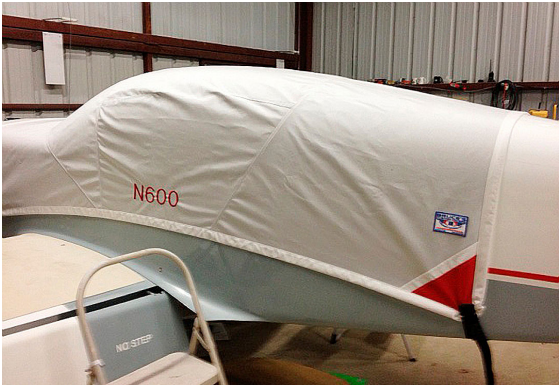
Glasair II/III Canopy Cover