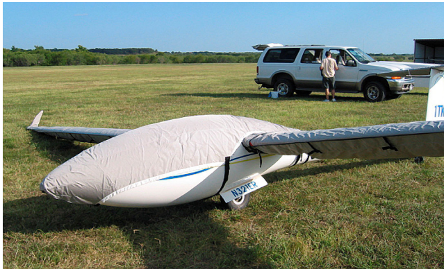
Canopy/Nose Cover, Wings and Horizontal Stab Covers