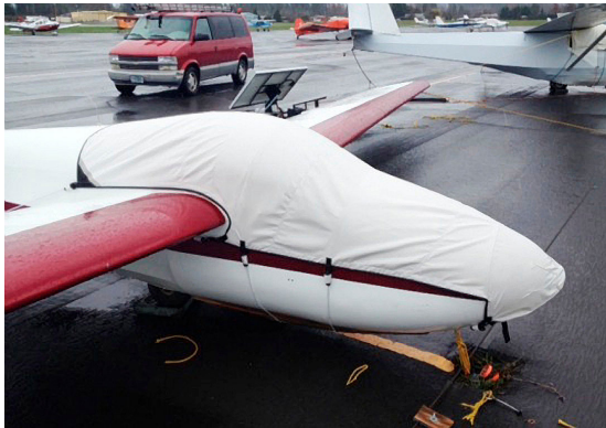
SGS 1-26B Canopy/Nose Cover