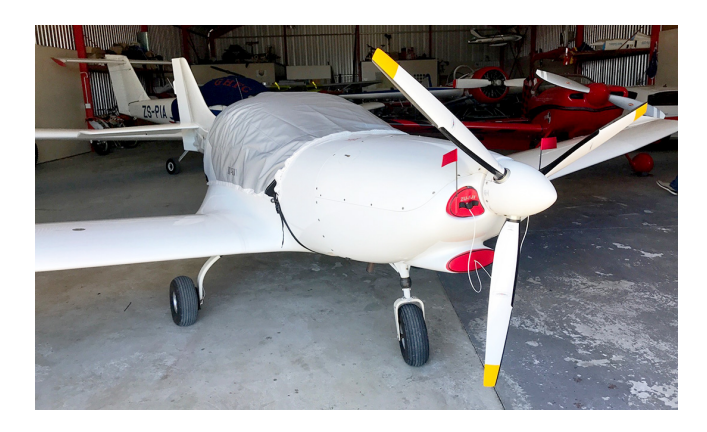
Gobosh 800XP Travel Cover, Light Weight Travel Canopy Cover and Inlet Plugs