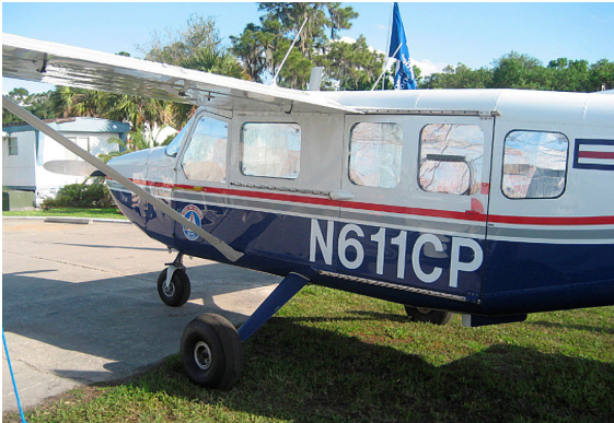
Gippsland GA-8 Airvan Cockpit & Cabin HeatShield Set