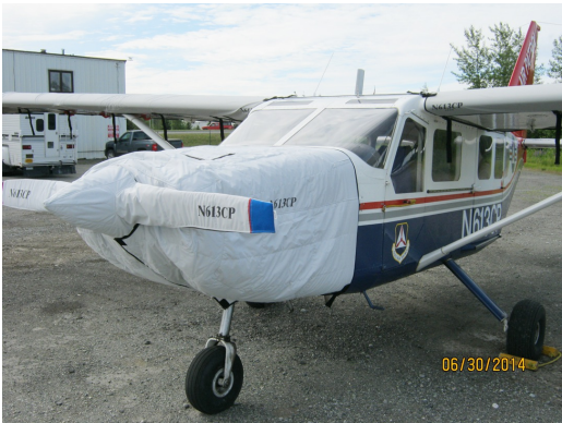
Gippsland GA-8 Airvan Insulated Engine and Prop Covers