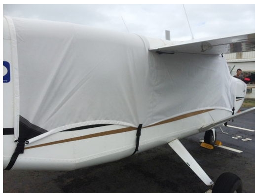
Gippsland GA-8 Airvan Canopy Cover

This cover type is made from Silver Acrylic Sunbrella canvas and is 100% lined with a soft and smooth microfiber. Bruce's Custom Covers developed this material combination especially for aircraft protection. The outer material is medium weight and treated for water resistance, UV resistance and anti-static buildup. The inner lining is a very soft and smooth microfiber to prevent scratching. The material is very reflective, and tests show that the cabin interior temperature can be reduced to near-ambient temperature on the hottest of days. It is water, ice and snow repellent, yet breathable to allow moisture to escape from between the cover and the aircraft surface.