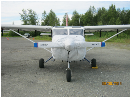
Gippsland GA-8 Airvan Insulated Engine and Prop Covers

This cover type is made from Silver Acrylic Sunbrella canvas and is 100% lined with a soft and smooth microfiber. Bruce's Custom Covers developed this material combination especially for aircraft protection. The outer material is medium weight and treated for water resistance, UV resistance and anti-static buildup. The inner lining is a very soft and smooth microfiber to prevent scratching. The material is very reflective, and tests show that the cabin interior temperature can be reduced to near-ambient temperature on the hottest of days. It is water, ice and snow repellent, yet breathable to allow moisture to escape from between the cover and the aircraft surface.