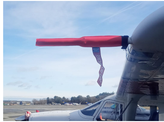
Gippsland GA-8 Airvan Pitot Cover