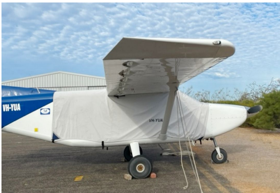
Gippsland GA-8 Extended Canopy Cover