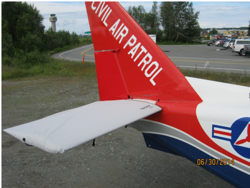
Gippsland GA-8 Airvan Horizontal Stab. Cover