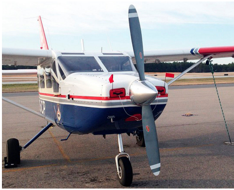
GA-8 Engine Inlet Plugs (set of 3)