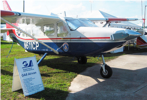
Gippsland GA-8 Airvan Cockpit & Cabin HeatShield Set

Cockpit Heatshields are interior sunshades for the aircraft's cockpit. The product is a unique composite of closed-cell foam with a silver mylar finish. The semi-rigid design is stiff enough to stand inside the window framing. The set folds up flat and is easily stored in the included storage sleeve. Some designs may require velcro and suction cups. A Heatshield is an excellent short-term remedy for cockpit overheating, but an external fabric cover is more effective for long-term protection.