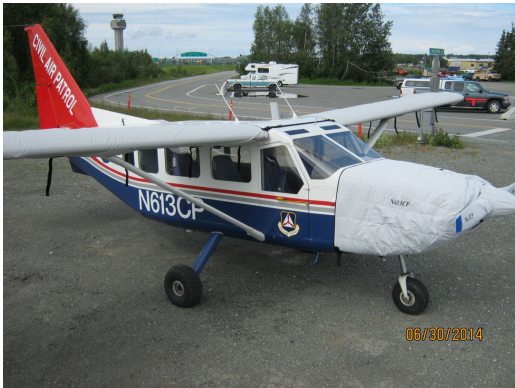
Gippsland GA-8 Airvan Insulated Engine, Wing and Prop Covers

shorter useful life if used continuously outside than the all-year use material.