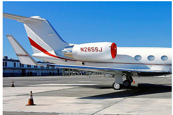
Gulfstream G-IV Intake Covers