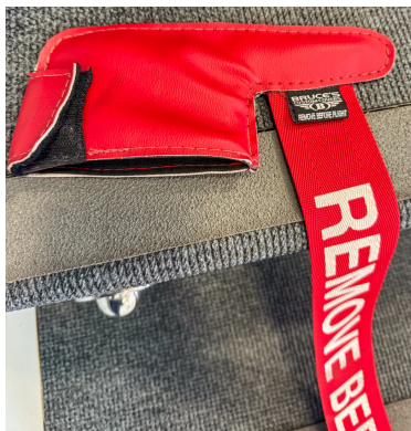
Gulfstream IV Pitot Cover

The Engine Inlet Plugs are custom fit for your Gulfstream Aerospace Gulfstream IV (C-20G), G350, G450 intakes, made with heavy-duty vinyl material, and stuffed with a single block of sculpted urethane foam. Each plug has a zipper that allows the foam to be removed and dried if necessary. Engine plugs have 'remove before flight' streamers sewn onto the face of the plugs. Most plugs are imprinted with the aircraft registration number in black for an extra charge. Storage bag NOT included. Engine plugs may be inserted after flight when the engine is still warm. Engine Inlet Plugs are commonly referred to as Cowl Plugs, Intake Plugs, Cowl Blocks, Engine Blocks, and Engine Bunges.