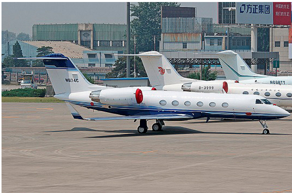
Gulfstream G-IV Intake Covers

The Gulfstream Aerospace Gulfstream IV (C-20G), G350, G450 Intake Covers are designed to install easily yet be completely storable. A spring steel hoop is sewn into the hem of each cover, allowing them to be installed without climbing onto the wing or using a stepladder. To store the covers the spring steel hoop folds like a band-saw blade into three nesting rings. Each cover folds into a compact circular bundle which is stored in the included duffle bag, yet they unfold quickly for use. The Tri-Fold Ring cover is made of medium weight nylon which is available in a variety of colors to match the paint trim. Each cover set comes complete with installation and folding instructions. The aircraft's registration number can be silkscreened onto the cover for an extra charge.