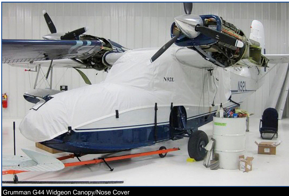
Grumman G44 Widgeon Canopy/Nose Cover