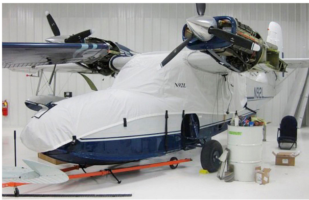
Grumman G44 Widgeon Canopy/Nose Cover