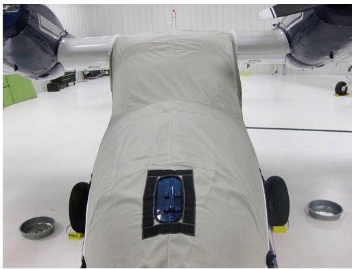
Grumman Widgeon Cockpit/Nose Cover, tie-down cleat detail