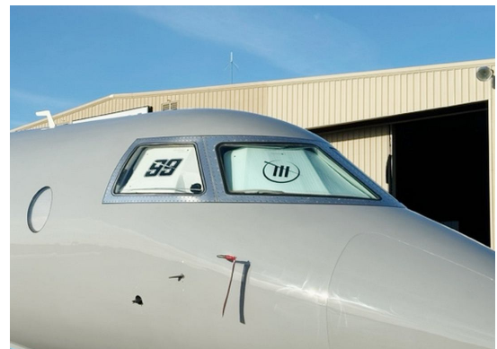
Gulfstream G200 Cockpit Heatshields