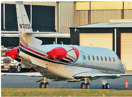
Gulfstream 200 Engine Cover set