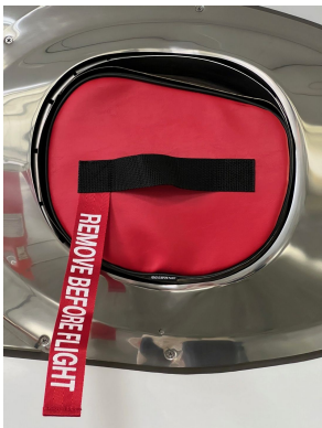
Gulfstream V APU Exhaust Plug