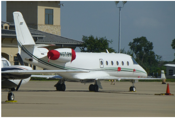
Gulfstream G150 Engine Cover Set