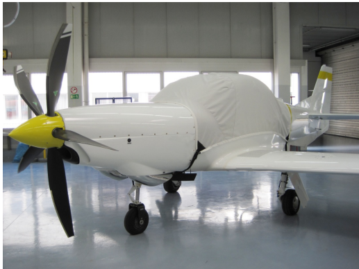
Grob 120TP Canopy Cover

The Grob 115 Canopy/Engine Cover is a one-piece cover (100% lined with microfiber) that is a combination of the Canopy Cover and Engine Cover. This cover will enclose the engine cowl and will extend aft to cover all of the windows. This cover type is made from Silver Acrylic Sunbrella canvas and is 100% lined with a soft and smooth microfiber. Bruce's Custom Covers developed this material combination especially for aircraft protection. The outer material is medium weight and treated for water resistance, UV resistance and anti-static buildup. The inner lining is a very soft and smooth microfiber to prevent scratching. The material is very reflective, and tests show that the cabin interior temperature can be reduced to near-ambient temperature on the hottest of days. It is water, ice and snow repellent, yet breathable to allow moisture to escape from between the cover and the aircraft surface.