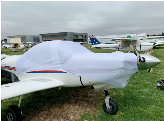
Grob 115 Canopy/Engine Cover, test fit cover