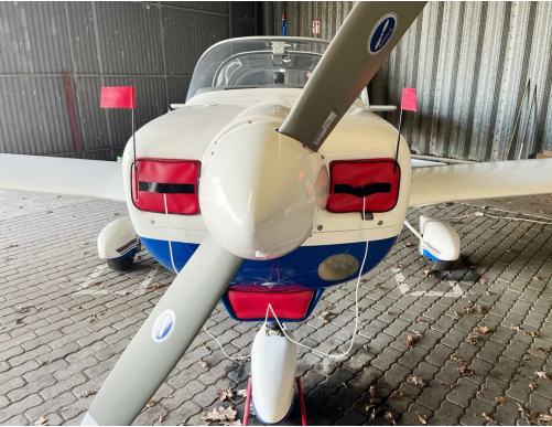
Grob 115 Engine Inlet Plugs, Incl. Carb. Inlet Plug