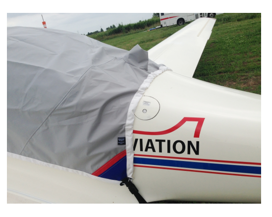
Grob 109 Travel Cover, Light Weight Travel Canopy Cover