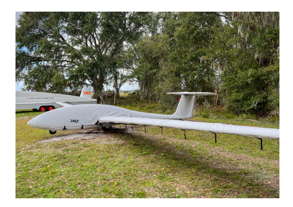
Burkhart Grob G 103 TWIN II Complete Cover Set