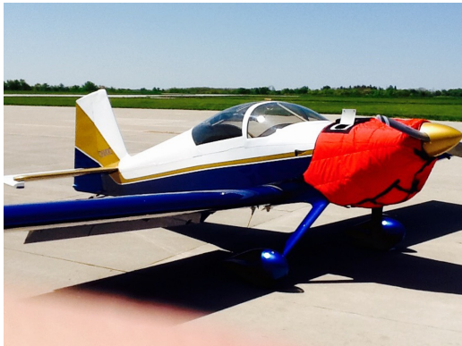
Van's RV-7 Insulated Engine Cover