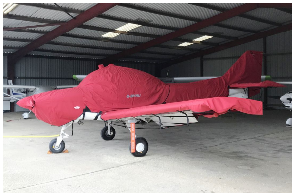
FLS Club Sprint Engine Cover

WINTER USE MATERIAL - Made with Solution-Dyed Polyester fabric, this option is intended for seasonal use to aid in deicing, rain mitigation, or for occasional travel. The material is lighter and more compact, but more susceptible to UV damage and may have a shorter useful life if used continuously outside than the all-year use material.