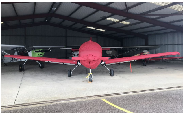
FLS Club Sprint Empennage Cover (Tailboom, Vertical & Horiz Stabilizers) All Year Use