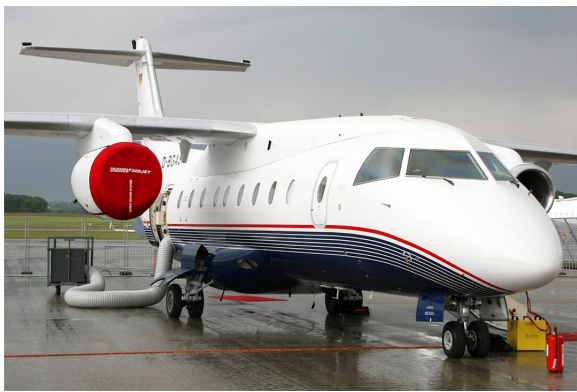
Fairchild/Dornier 328 Engine Covers