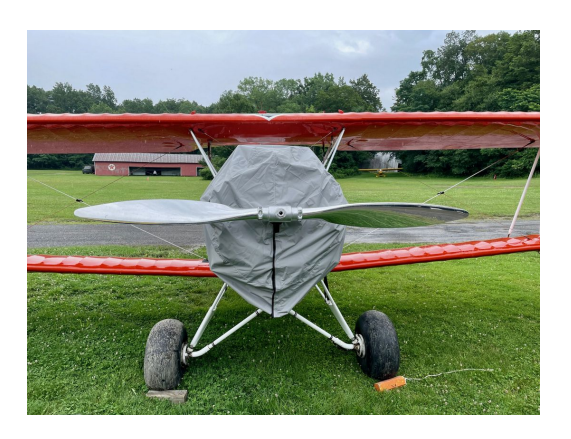
Fleet Biplane Model 1 Canopy & Engine Covers