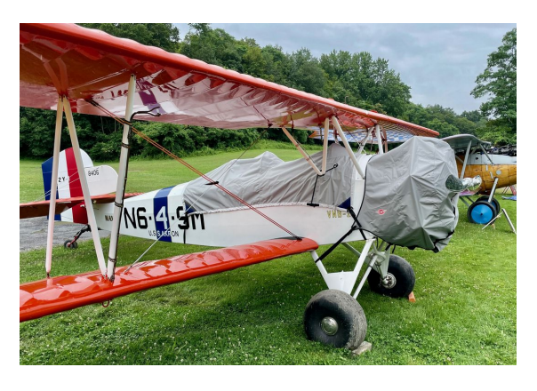
Fleet Biplane Model 1 Canopy & Engine Covers