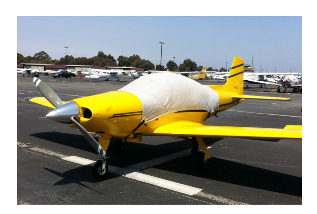
Falco Canopy Cover