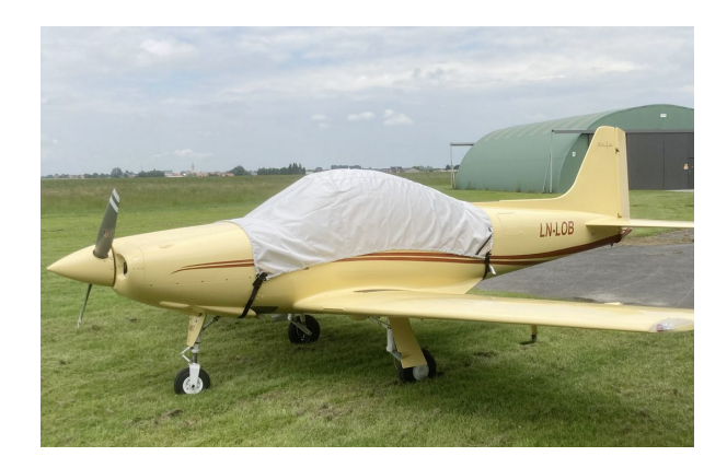
Sequoia Falco Canopy Cover

This cover type is made from Silver Acrylic Sunbrella canvas and is 100% lined with a soft and smooth microfiber. Bruce's Custom Covers developed this material combination especially for aircraft protection. The outer material is medium weight and treated for water resistance, UV resistance and anti-static buildup. The inner lining is a very soft and smooth microfiber to prevent scratching. The material is very reflective, and tests show that the cabin interior temperature can be reduced to near-ambient temperature on the hottest of days. It is water, ice and snow repellent, yet breathable to allow moisture to escape from between the cover and the aircraft surface.