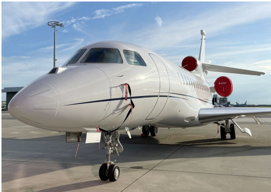
Falcon 7X Engine Cover Set, Pitot Covers