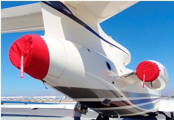
Falcon 7X Exhaust Covers

The Falcon Jet 7X Intake Covers are designed to install easily yet be completely storable. A spring steel hoop is sewn into the hem of each cover, allowing them to be installed without climbing onto the wing or using a stepladder. To store the covers the spring steel hoop folds like a band-saw blade into three nesting rings. Each cover folds into a compact circular bundle which is stored in the included duffle bag, yet they unfold quickly for use. The Tri-Fold Ring cover is made of medium weight nylon which is available in a variety of colors to match the paint trim. Each cover set comes complete with installation and folding instructions. The aircraft's registration number can be silkscreened onto the cover for an extra charge.