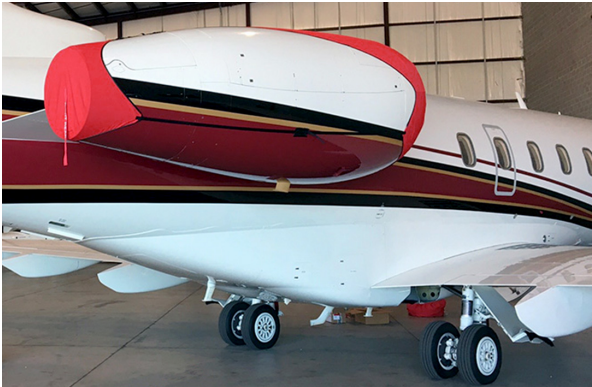
Intake/Exhaust Covers, 3-Strap Type. Successfully installed by two crew, one ladder.

The Falcon Jet 6X Bikini Style Engine Covers are a single-piece design using a soft and smooth stretchy and fabric. The cover stretches tightly over both the intake and exhaust, installing quickly and easily. These covers are designed to be used as hangar dust covers and have a useful life of approximately one year.