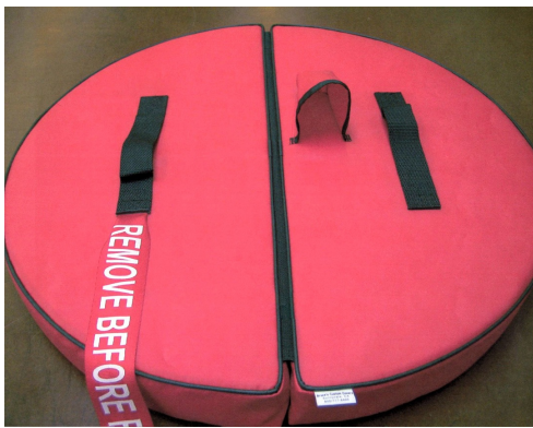
Falcon Center Engine Intake Plug