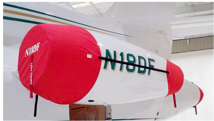
Falcon 900 Engine Cover Set