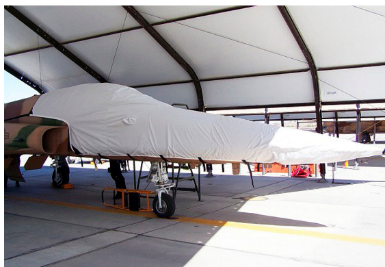
Northup F-5 Talon Canopy/Nose Cover