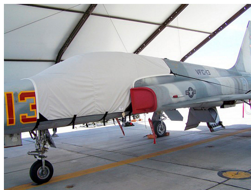
Northup F5 Talon Canopy Cover