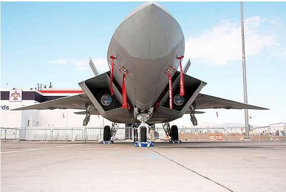
F-22 Raptor Engine Inlet Plugs Set

The Engine Inlet Plugs are custom fit for your Lockheed Martin/Boeing F-22 Raptor intakes, made with heavy-duty vinyl material, and stuffed with a single block of sculpted urethane foam. Each plug has a zipper that allows the foam to be removed and dried if necessary. Engine plugs have 'remove before flight' streamers sewn onto the face of the plugs. Most plugs are imprinted with the aircraft registration number in black for an extra charge. Storage bag NOT included. Engine plugs may be inserted after flight when the engine is still warm. Engine Inlet Plugs are commonly referred to as Cowl Plugs, Intake Plugs, Cowl Blocks, Engine Blocks, and Engine Bunges.