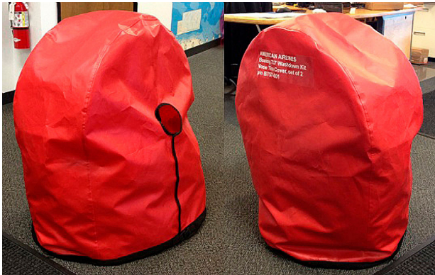
Boeing 757 Tire Covers, great for Wash Prep or Storage