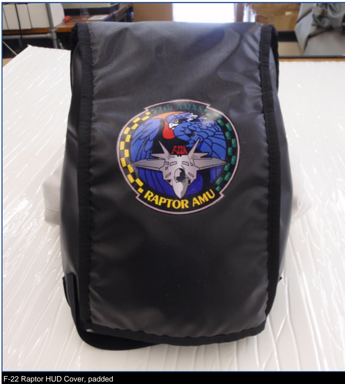
F-22 Raptor HUD Cover, padded