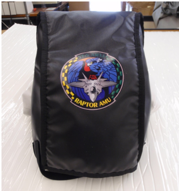
F-22 Raptor HUD Cover, padded