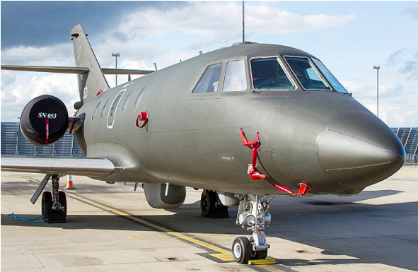
Falcon Engine Covers (not our probe covers)

The Engine Inlet Plugs are custom fit for your Falcon Jet 200 (20H) intakes, made with heavy-duty vinyl material, and stuffed with a single block of sculpted urethane foam. Each plug has a zipper that allows the foam to be removed and dried if necessary. Engine plugs have 'remove before flight' streamers sewn onto the face of the plugs. Most plugs are imprinted with the aircraft registration number in black for an extra charge. Storage bag NOT included. Engine plugs may be inserted after flight when the engine is still warm. Engine Inlet Plugs are commonly referred to as Cowl Plugs, Intake Plugs, Cowl Blocks, Engine Blocks, and Engine Bungs.