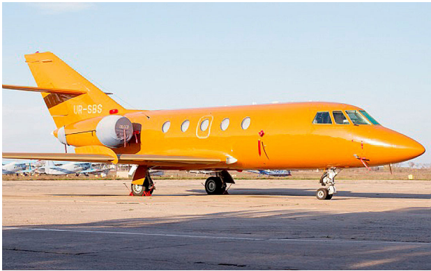
Falcon Engine Covers

The Falcon Jet 200 (20H) Intake Covers are designed to install easily yet be completely storable. A spring steel hoop is sewn into the hem of each cover, allowing them to be installed without climbing onto the wing or using a stepladder. To store the covers the spring steel hoop folds like a band-saw blade into three nesting rings. Each cover folds into a compact circular bundle which is stored in the included duffle bag, yet they unfold quickly for use. The Tri-Fold Ring cover is made of medium weight nylon which is available in a variety of colors to match the paint trim. Each cover set comes complete with installation and folding instructions. The aircraft's registration number can be silkscreened onto the cover for an extra charge.