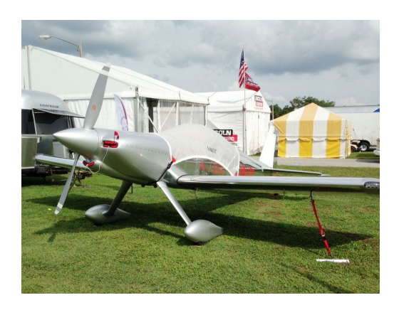
ENGINE PLUGS PREVENT BIRD NEST FOD. Piper Saratoga Engine Cowling Bird's F1 Rocket Canopy Cover, Engine Plugs Nest