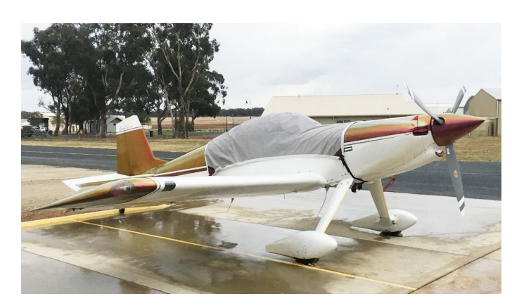
F1 Rocket Travel Cover, Light Weight Travel Canopy Cover, Bubble Windshield, Engine Plugs