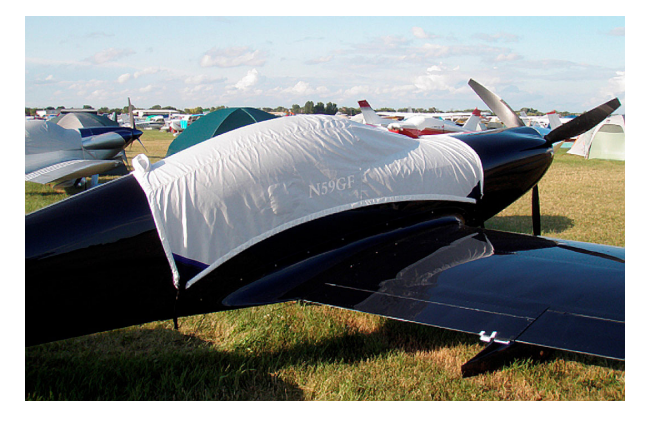
F1 Rocket Canopy Cover

This cover type is made from Silver Acrylic Sunbrella canvas and is 100% lined with a soft and smooth microfiber. Bruce's Custom Covers developed this material combination especially for aircraft protection. The outer material is medium weight and treated for water resistance, UV resistance and anti-static buildup. The inner lining is a very soft and smooth microfiber to prevent scratching. The material is very reflective, and tests show that the cabin interior temperature can be reduced to near-ambient temperature on the hottest of days. It is water, ice and snow repellent, yet breathable to allow moisture to escape from between the cover and the aircraft surface.