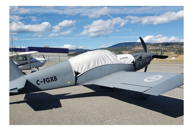
F1 Rocket Canopy Cover