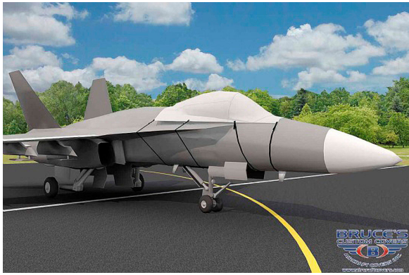
F-18 Canopy Cover, illustration