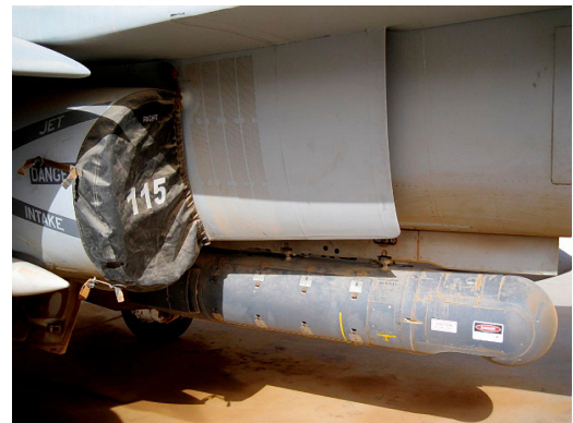
F-18 Intake Covers