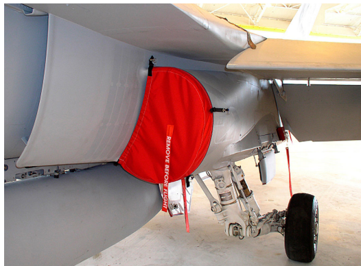
F-18 Engine Inlet Cover

The McDonnell Douglas F-18 Hornet, Super Hornet Intake Covers are designed to install easily yet be completely storable. A spring steel hoop is sewn into the hem of each cover, allowing them to be installed without climbing onto the wing or using a stepladder. To store the covers the spring steel hoop folds like a band-saw blade into three nesting rings. Each cover folds into a compact circular bundle which is stored in the included duffle bag, yet they unfold quickly for use. The Tri-Fold Ring cover is made of medium weight nylon which is available in a variety of colors to match the paint trim. Each cover set comes complete with installation and folding instructions. The aircraft's registration number can be silkscreened onto the cover for an extra charge.