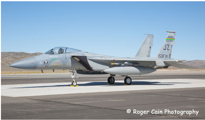
McDonnell-Douglas F-15 Intake Covers