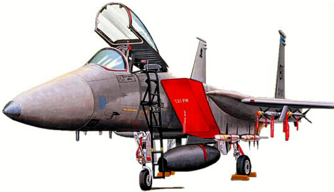
F15 Cockpit HeatShields & Inlet Cover

The McDonnell Douglas F-15 Eagle Intake Covers are designed to install easily yet be completely storable. A spring steel hoop is sewn into the hem of each cover, allowing them to be installed without climbing onto the wing or using a stepladder. To store the covers the spring steel hoop folds like a band-saw blade into three nesting rings. Each cover folds into a compact circular bundle which is stored in the included duffle bag, yet they unfold quickly for use. The Tri-Fold Ring cover is made of medium weight nylon which is available in a variety of colors to match the paint trim. Each cover set comes complete with installation and folding instructions. The aircraft's registration number can be silkscreened onto the cover for an extra charge.