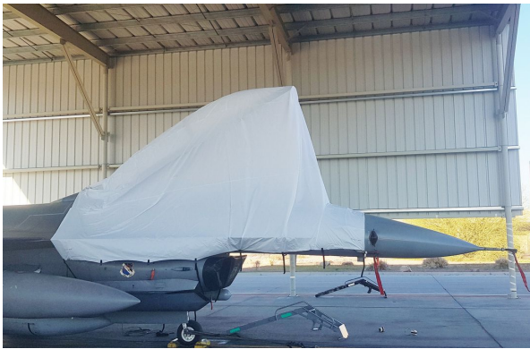
McDonnell Douglas F16-D Canopy Cover, open cockpit type (test fit cover)

Canopy Covers are commonly referred to as Cabin Covers, Fuselage Covers, Canvas Covers, Canopy Caps, etc.