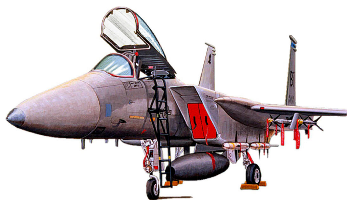
F15 Cockpit HeatShields & Intake Plugs

The Engine Inlet Plugs are custom fit for your McDonnell Douglas F-15 Eagle intakes, made with heavy-duty vinyl material, and stuffed with a single block of sculpted urethane foam. Each plug has a zipper that allows the foam to be removed and dried if necessary. Engine plugs have 'remove before flight' streamers sewn onto the face of the plugs. Most plugs are imprinted with the aircraft registration number in black for an extra charge. Storage bag NOT included. Engine plugs may be inserted after flight when the engine is still warm. Engine Inlet Plugs are commonly referred to as Cowl Plugs, Intake Plugs, Cowl Blocks, Engine Blocks, and Engine Bungs.