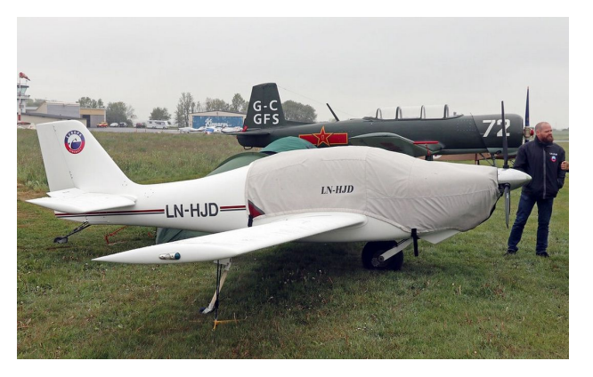
Europa Canopy/Engine Cover