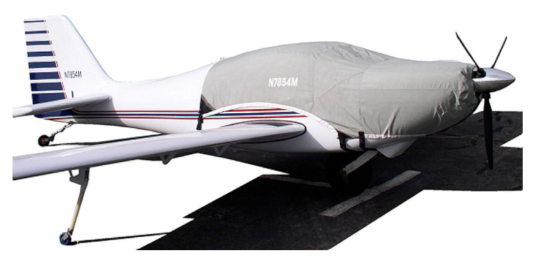
Europa Canopy/Engine Cover

The Europa All Europa Models Canopy/Engine Cover is a one-piece cover (100% lined with microfiber) that is a combination of the Canopy Cover and Engine Cover. This cover will enclose the engine cowl and will extend aft to cover all of the windows. This cover type is made from Silver Acrylic Sunbrella canvas and is 100% lined with a soft and smooth microfiber. Bruce's Custom Covers developed this material combination especially for aircraft protection. The outer material is medium weight and treated for water resistance, UV resistance and anti-static buildup. The inner lining is a very soft and smooth microfiber to prevent scratching. The material is very reflective, and tests show that the cabin interior temperature can be reduced to near-ambient temperature on the hottest of days. It is water, ice and snow repellent, yet breathable to allow moisture to escape from between the cover and the aircraft surface.