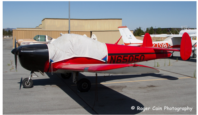
Ercoupe Canopy Cover