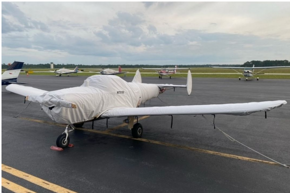
Ercoupe Complete Cover Set

WINTER USE MATERIAL - Made with Solution-Dyed Polyester fabric, this option is intended for seasonal use to aid in deicing, rain mitigation, or for occasional travel. The material is lighter and more compact, but more susceptible to UV damage and may have a shorter useful life if used continuously outside than the all-year use material.