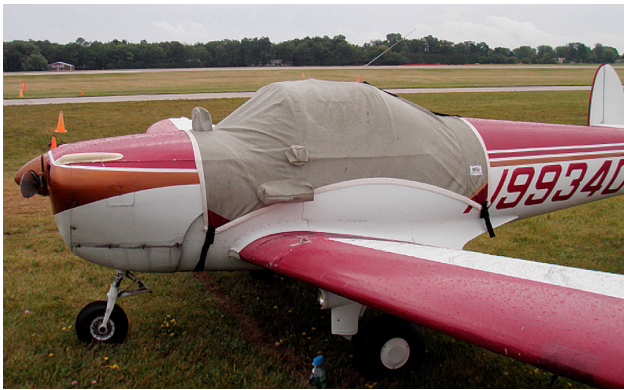
Ercoupe Canopy Cover, flat windshield model

Travel Covers are made with Silver Solution-Dyed Polyester fabric and only lined over the windshield to save weight. The material is lightweight and more compact for easy stowage in the aircraft. The polyester material is water resistant, but only intended for occasional use outside. We also have an ultra lightweight material available for fitted hangar dust covers. For daily outdoor use, the non-travel Sunbrella Cover is the best choice.