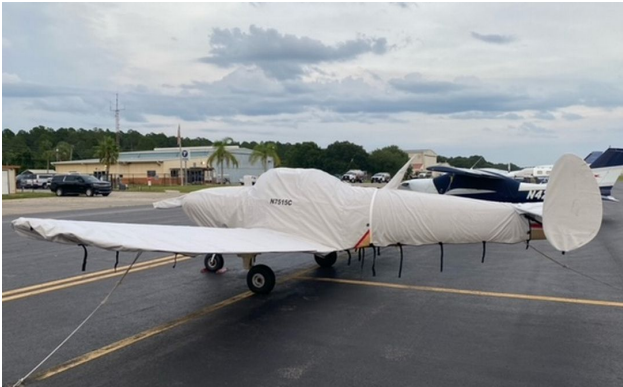
Ercoupe Complete Cover Set

This cover type is made from Silver Acrylic Sunbrella canvas and is 100% lined with a soft and smooth microfiber. Bruce's Custom Covers developed this material combination especially for aircraft protection. The outer material is medium weight and treated for water resistance, UV resistance and anti-static buildup. The inner lining is a very soft and smooth microfiber to prevent scratching. The material is very reflective, and tests show that the cabin interior temperature can be reduced to near-ambient temperature on the hottest of days. It is water, ice and snow repellent, yet breathable to allow moisture to escape from between the cover and the aircraft surface.