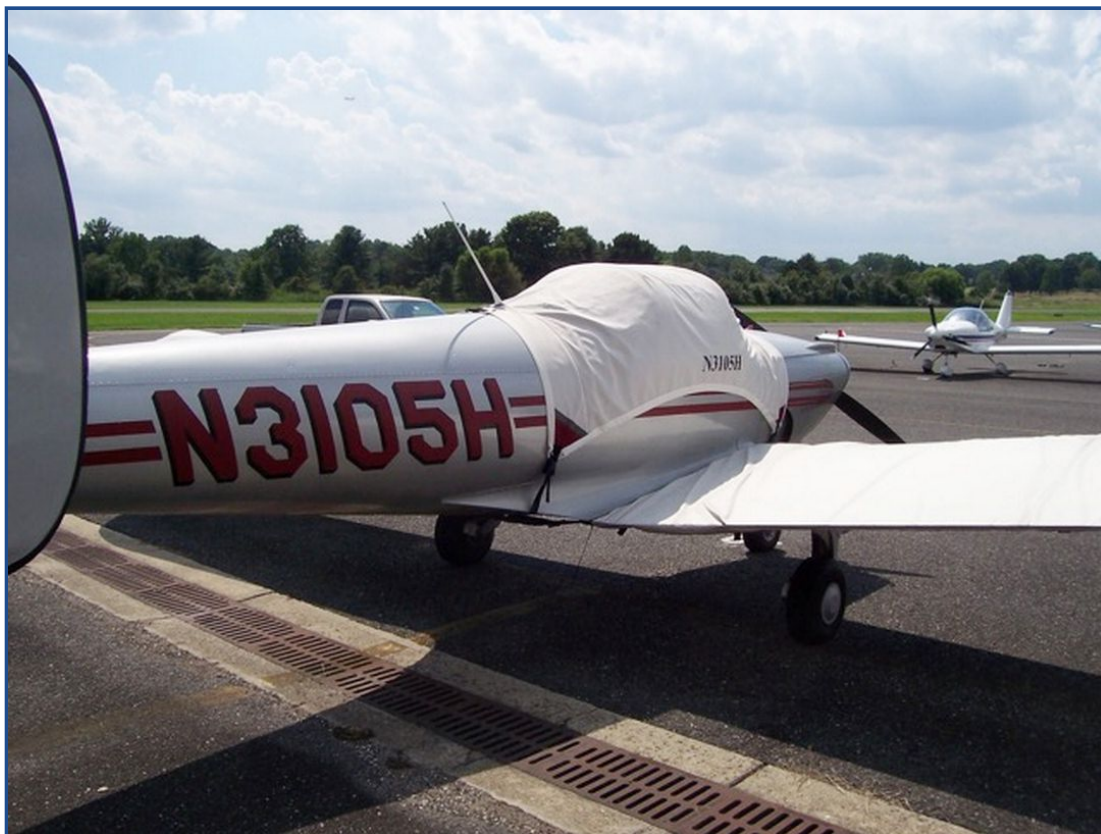
Ercoupe Canopy Cover