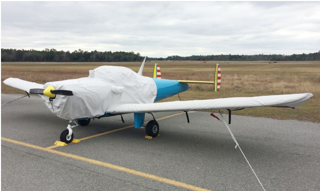
Ercoupe Extended Canopy/Engine Cover, and Wing Covers