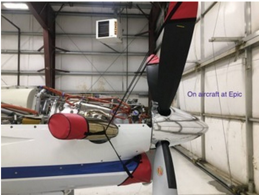
Epic Aircraft Prop Tie, Exhaust & Intake Covers

This cover type is made from Silver Acrylic Sunbrella canvas and is 100% lined with a soft and smooth microfiber. Bruce's Custom Covers developed this material combination especially for aircraft protection. The outer material is medium weight and treated for water resistance, UV resistance and anti-static buildup. The inner lining is a very soft and smooth microfiber to prevent scratching. The material is very reflective, and tests show that the cabin interior temperature can be reduced to near-ambient temperature on the hottest of days. It is water, ice and snow repellent, yet breathable to allow moisture to escape from between the cover and the aircraft surface.