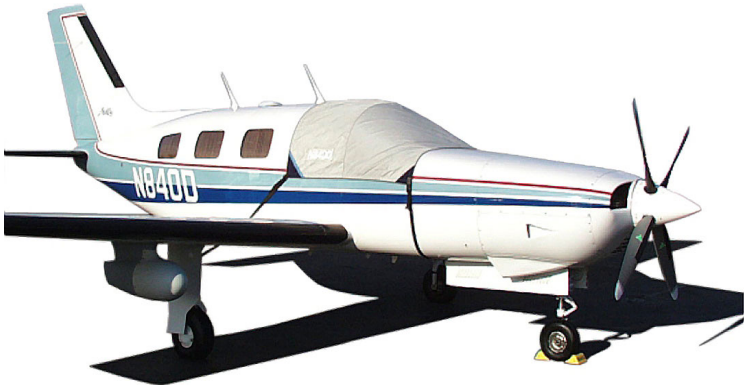
Piper Malibu/Mirage Windshield Cover