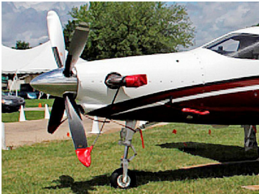
Epic Prop Tie-down/Exhaust cover set