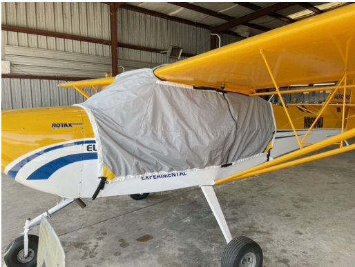
Eurofox Travel Weight Canopy Cover

Travel Covers are made with Silver Solution-Dyed Polyester fabric and only lined over the windshield to save weight. The material is lightweight and more compact for easy stowage in the aircraft. The polyester material is water resistant, but only intended for occasional use outside. We also have an ultra lightweight material available for fitted hangar dust covers. For daily outdoor use, the non-travel Sunbrella Cover is the best choice.