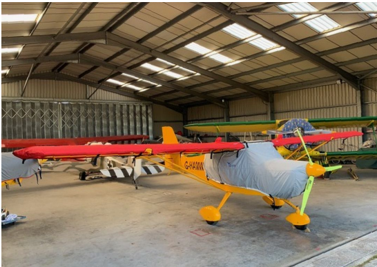
Eurofox Canopy/Engine Cover, light weight travel type