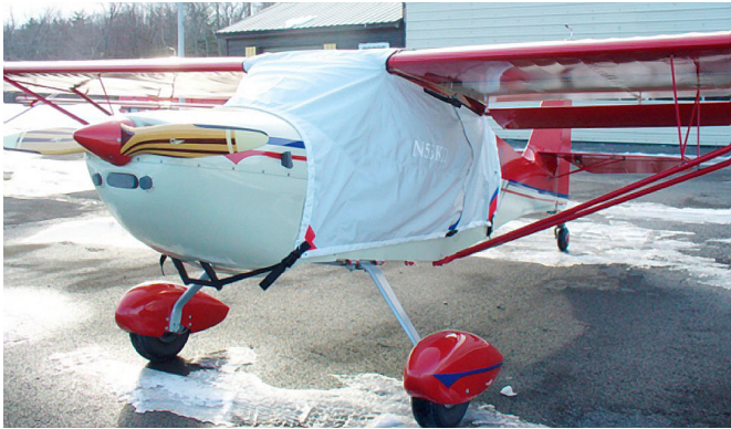
Kitfox IV Over-the-top Canopy Cover

This cover type is made from Silver Acrylic Sunbrella canvas and is 100% lined with a soft and smooth microfiber. Bruce's Custom Covers developed this material combination especially for aircraft protection. The outer material is medium weight and treated for water resistance, UV resistance and anti-static buildup. The inner lining is a very soft and smooth microfiber to prevent scratching. The material is very reflective, and tests show that the cabin interior temperature can be reduced to near-ambient temperature on the hottest of days. It is water, ice and snow repellent, yet breathable to allow moisture to escape from between the cover and the aircraft surface.