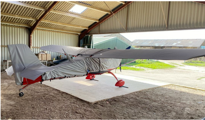
Eurofox Complete Cover Set