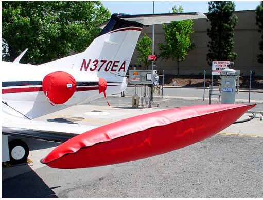
Eclipse Tip Tank & Engine Covers

Designed to prevent damage to the aircraft extremities in crowded hangars, these products are made of bright red Naugahyde and thickly padded with a sandwich of closed cell foam.