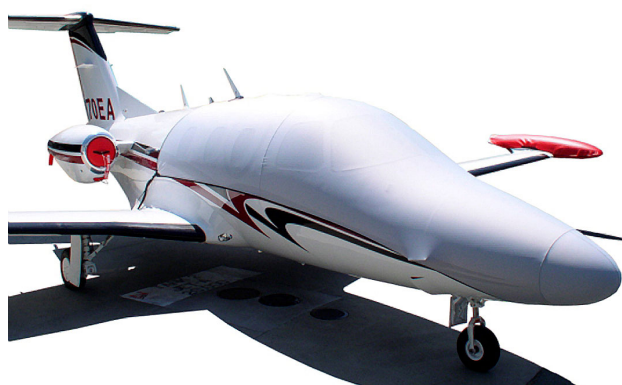
Hangar Dust, Canopy/Nose Cover, Engine Plugs & Tip Tank Pad