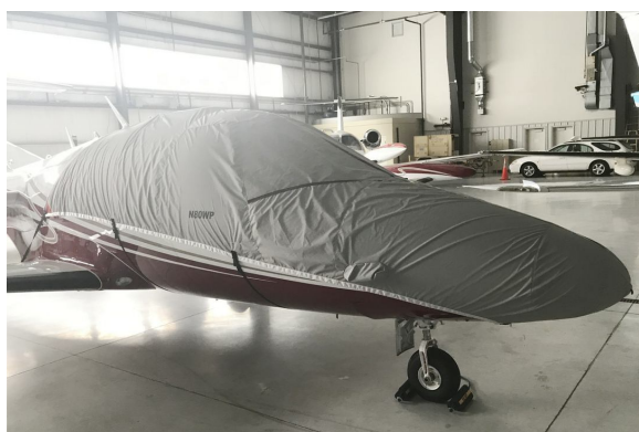
Eclipse EA550 Travel Canopy/Nose Cover

This cover type is made from Silver Acrylic Sunbrella canvas and is 100% lined with a soft and smooth microfiber. Bruce's Custom Covers developed this material combination especially for aircraft protection. The outer material is medium weight and treated for water resistance, UV resistance and anti-static buildup. The inner lining is a very soft and smooth microfiber to prevent scratching. The material is very reflective, and tests show that the cabin interior temperature can be reduced to near-ambient temperature on the hottest of days. It is water, ice and snow repellent, yet breathable to allow moisture to escape from between the cover and the aircraft surface.