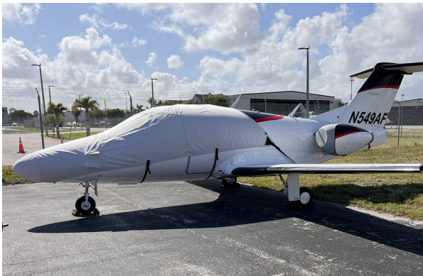
Eclipse EA500 Canopy/Nose Cover