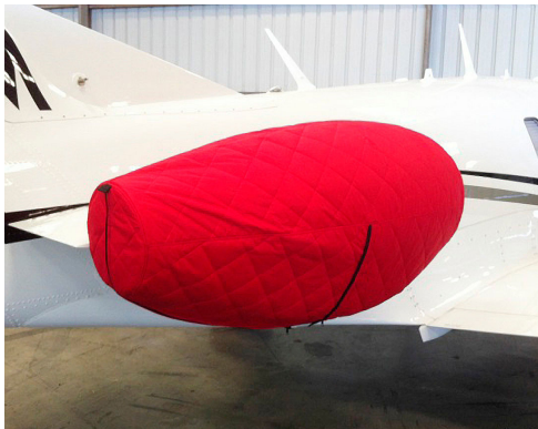
Eclipse Insulated Engine Cover