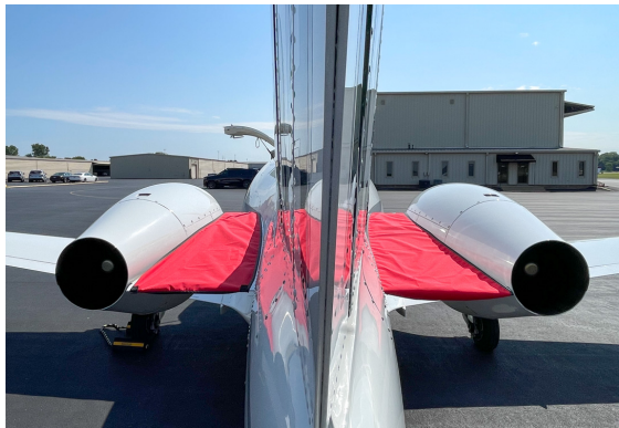
Eclipse EA500, TE500, 550 Pylon Covers

The Eclipse EA500, TE500, 550 Bikini Style Engine Covers are a single-piece design using a soft and smooth stretchy and fabric. The cover stretches tightly over both the intake and exhaust, installing quickly and easily. These covers are designed to be used as hangar dust covers and have a useful life of approximately one year.