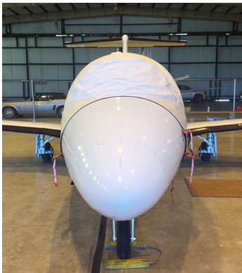
Eclipse Cockpit Door Cover, with Pitot Tube Covers

This cover type is made from Silver Acrylic Sunbrella canvas and is 100% lined with a soft and smooth microfiber. Bruce's Custom Covers developed this material combination especially for aircraft protection. The outer material is medium weight and treated for water resistance, UV resistance and anti-static buildup. The inner lining is a very soft and smooth microfiber to prevent scratching. The material is very reflective, and tests show that the cabin interior temperature can be reduced to near-ambient temperature on the hottest of days. It is water, ice and snow repellent, yet breathable to allow moisture to escape from between the cover and the aircraft surface.