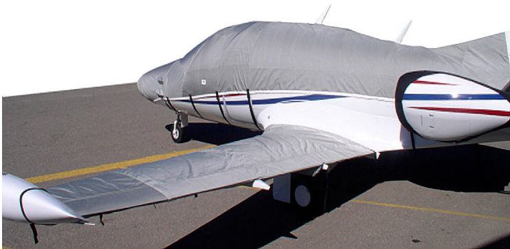
Fuselage Cover & Wing Covers with hail protection on all upper surfaces

WINTER USE MATERIAL - Made with Solution-Dyed Polyester fabric, this option is intended for seasonal use to aid in deicing, rain mitigation, or for occasional travel. The material is lighter and more compact, but more susceptible to UV damage and may have a shorter useful life if used continuously outside than the all-year use material.