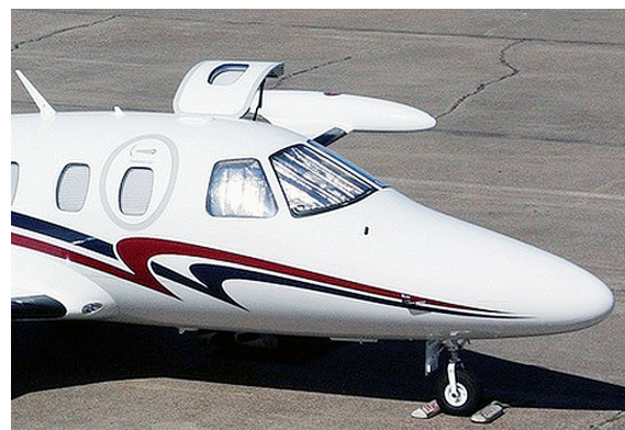
Eclipse Cockpit Heatshields