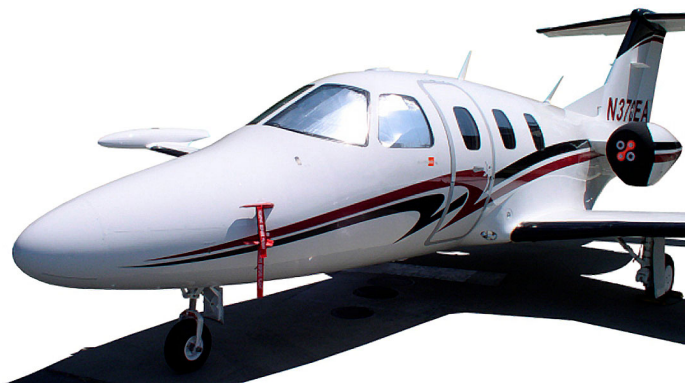
Cockpit HeatShields, Pitot Covers & "Bikini" style Engine Covers