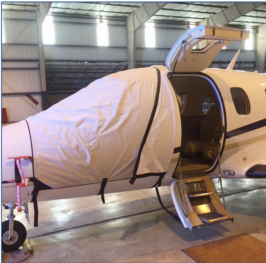
Eclipse Cockpit Door Cover, with Pitot Tube Covers