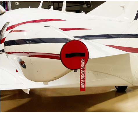
Eclipse EA500 Intake/Exhaust Plugs