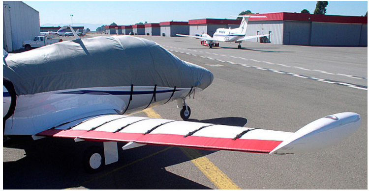
Fuselage Cover with Hail Protection & Wing Control Surfaces Hail Protection Pads