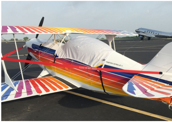
Christen Eagle Canopy Cover