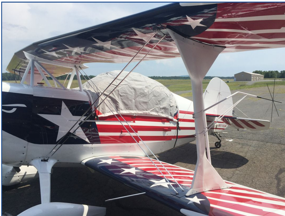
Christen Eagle Light Weight Travel Canopy Cover