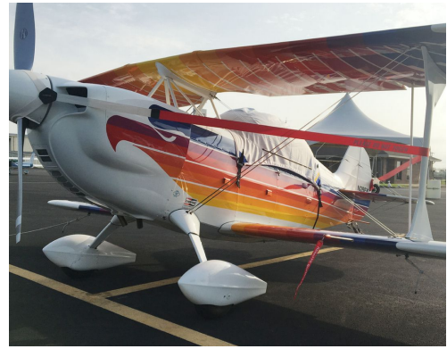
Christen Eagle Canopy Cover