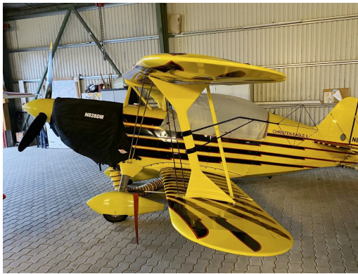
Christen Eagle Insulated Engine Cover

the hottest of days. It is water, ice and snow repellent, yet breathable to allow moisture to escape from between the cover and the aircraft surface.