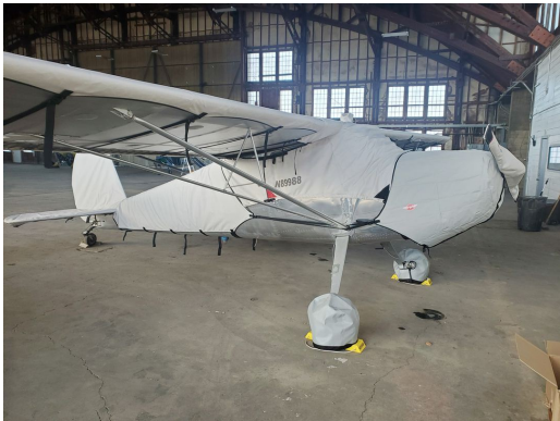
Cessna 140 Canopy, Wings, Prop, Tires & Empennage Covers