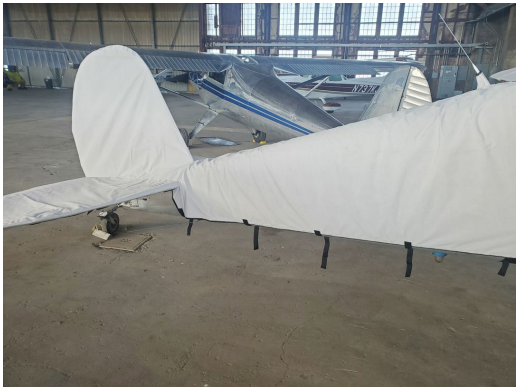
Cessna 140 Empennage Cover

WINTER USE MATERIAL - Made with Solution-Dyed Polyester fabric, this option is intended for seasonal use to aid in deicing, rain mitigation, or for occasional travel. The material is lighter and more compact, but more susceptible to UV damage and may have a shorter useful life if used continuously outside than the all-year use material.