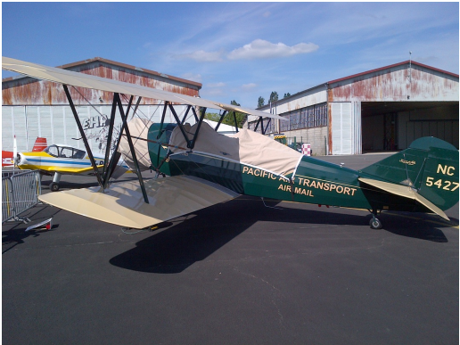
Travelair 4000 Canopy and Engine Cover