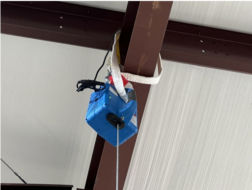
Stearman PT-13 Full Body Dust Cover, Remote Control Winch