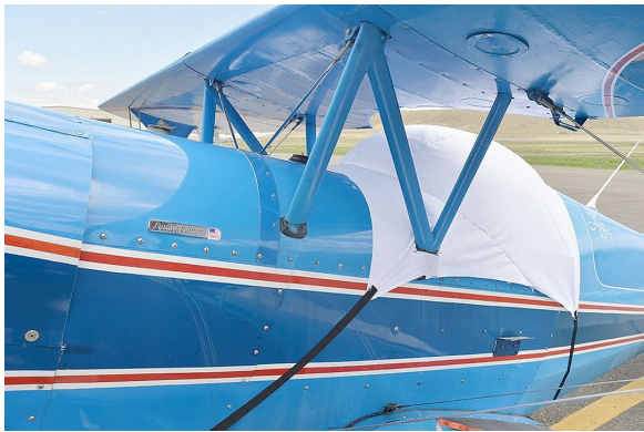
Acro Sport Canopy Cover

the hottest of days. It is water, ice and snow repellent, yet breathable to allow moisture to escape from between the cover and the aircraft surface.